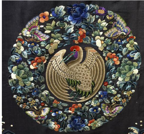
Figure 3. Partial view of the double-breasted and auspicious jacket with round crane, flower, and butterfly patterns

of various colors. The needlework was smooth and bright, and the color matching was clear and contrasting, showing the magnificence and nobility of royal clothing ( Figure 2 ). It can be seen that the plant patterns were gradually applied to plant fabrics during the Shang and Zhou Dynasties, and different decorative patterns and clothing materials were used to reflect the social meaning and social hierarchy. The ancient people used different plant patterns to highlight their social status and identity, therefore, it can be said that the development of spiritual civilization is inseparable from the development of plant patterns [3] .