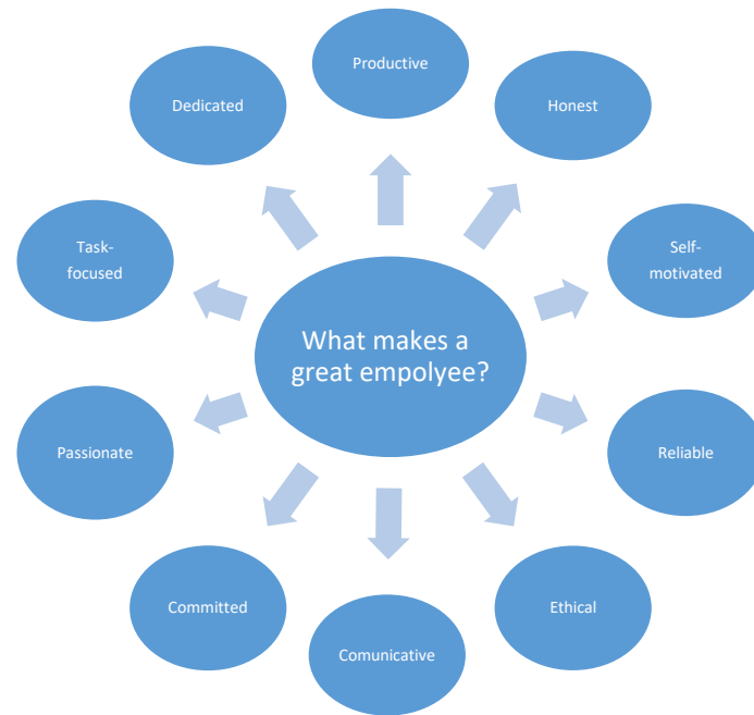
Figure 3. Ideal characteristics of senior talents