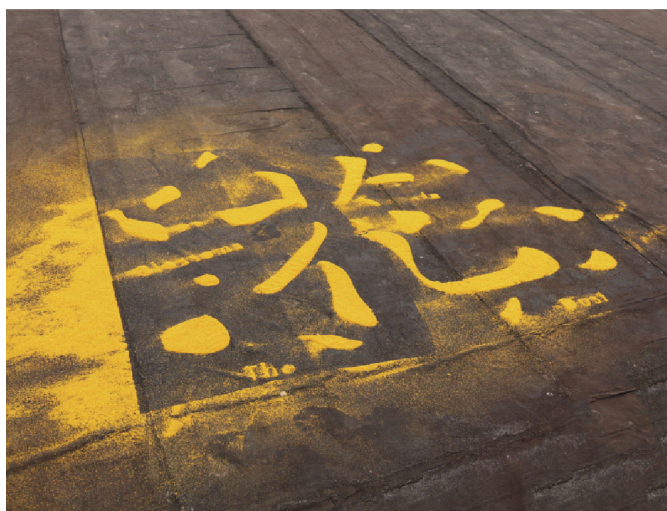
Figure 2. Font experiment theatre

Fun font design is a design that undergoes transformations in font shape and decorative effects in font design. At the same time, the shape of the font is changed in the continuous trial and exploration. Fun is one of the characteristics of experimental fonts. In experimental fonts, fun not only makes people happy, excited, and curious, but also allows people to try new design research or bring different design ideas and thoughts. Usually font design is considered by designers to be highly recognizable, and the design is relatively simple to convey the message that recipient wants to convey. Experimental fonts often give people the feeling that they are not bored at the beginning and the results are unknown. There will be new discoveries and different results in every experiment. In today's fast-paced lifestyle, there are many variations in font design, and it's no longer sticking to conventions. Designers gradually integrate interesting elements into font design, and even integrate real social issues in it to make the design warmer on the basis of recognition and