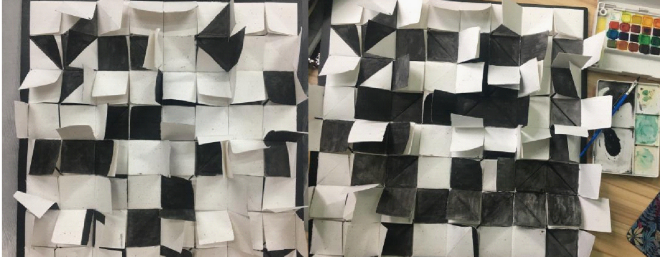
Figure 4. Snapshots of Chinese Character Game Design