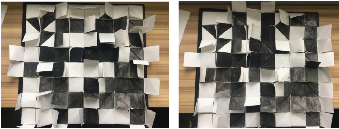
Figure 5. Interactive puzzles

Interactive Chinese character games have aroused people's interest in Chinese character learning. "Interaction" is a sociological term that refers to the way people send, disseminate and feedback various information in real-time in an information exchange system. Audiences and readers can not only receive