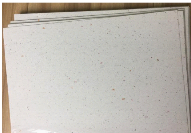
Figure 3. Paper Photograph

In the design of Chinese character games, the placement and processing of each color block, the depth and angle of the color block are used to enable users to "follow the heart" in achieving different empathy and visual effects.