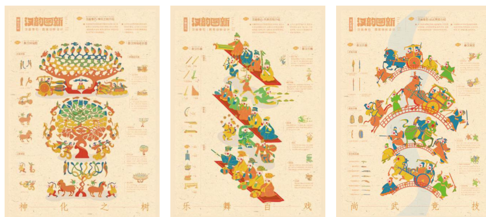
Figure 1. Information chart design of Chinese portrait stone (Author-created)

The design is developed from three dimensions: entertainment, spirituality, and competition. The layout and color are determined based on the characteristics of different carriers, achieving a balance between visual contrast and harmony, as guided by the research on the integration of traditional crafts and modern design (Figure 1) [11] .