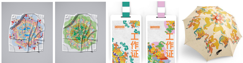
Figure 3. Innovation and extension design of Chinese portrait stone (Author-created)

The design, themed “Han Rhythm, Modern Innovation”, targets young people, traditional culture lovers, and international audiences. It combines auspicious decorative elements with representative motifs of Han stone reliefs, achieving a harmonious composition that unifies visual appeal and cultural depth, as validated by the research in (Figure 3) [1, 3].