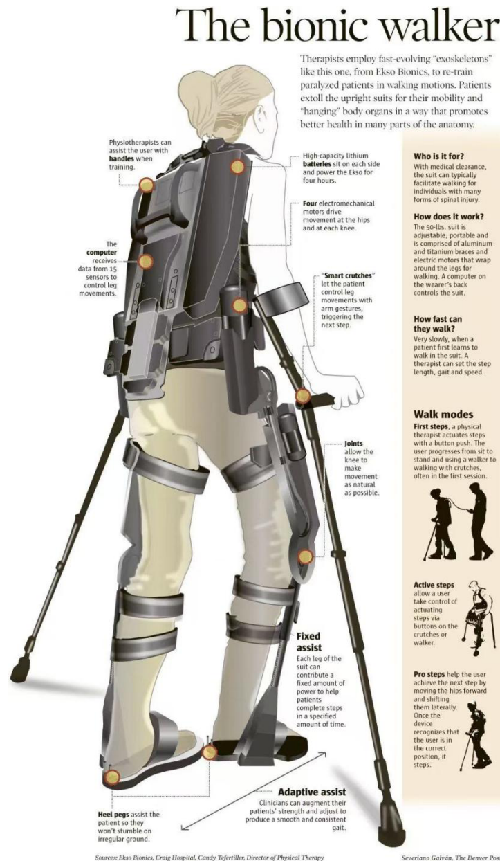
Figure 1. Ekso Bionics rehabilitation product.

Globally, Honda's exoskeletons primarily serve industrial heavy-load applications, while Ekso Bionics focuses on medical rehabilitation. However, both face common challenges like high costs and lengthy customization cycles. In contrast, domestic counterparts mostly remain at the basic mechanical-assistance stage, lacking both intelligent features and adaptability to diverse scenarios. As illustrated in Figure 1 , Ekso Bionics [4] ' rehabilitation product, vividly demonstrates this industry reality [5] .