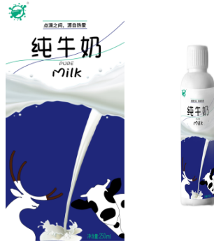
Figure 2. Brand packaging