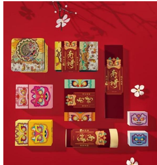
Figure 1. Mooncake packaging design (Source: Packaging design by Liang Jiajie)