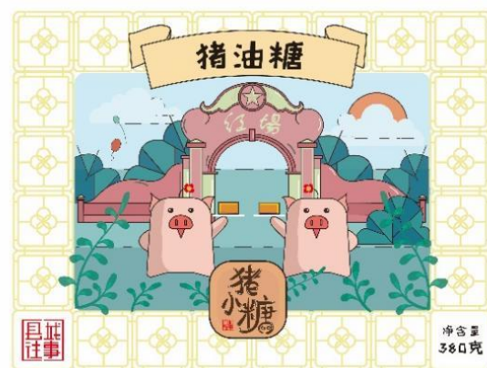
Figure 2. Lard candy packaging design (Source: Packaging design by An Yukang)