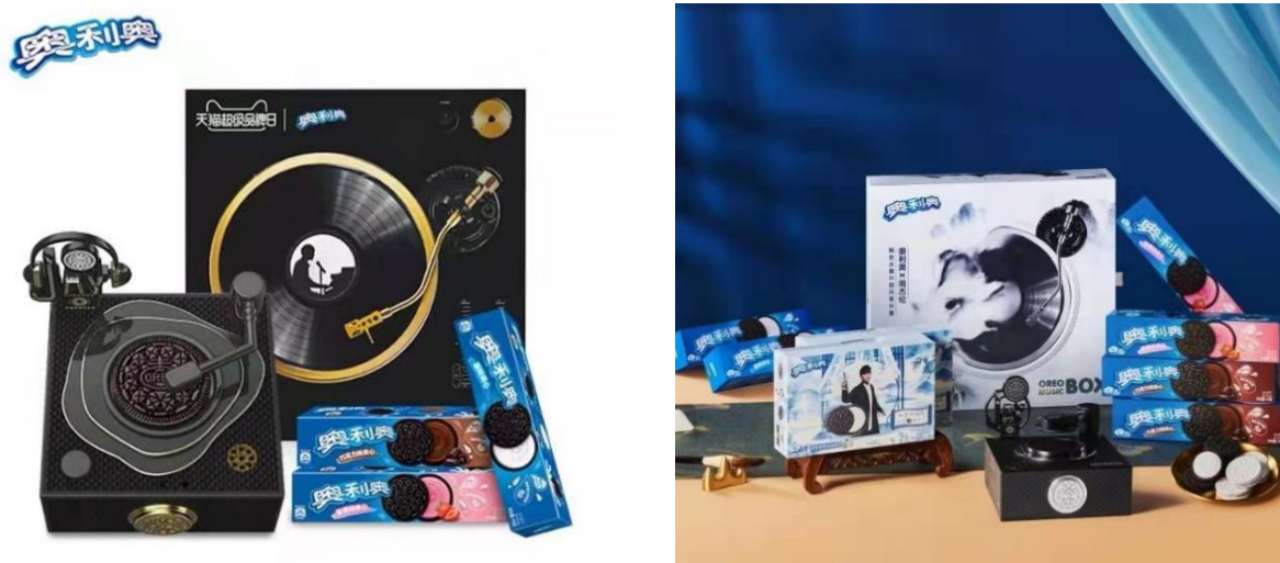
Figure 3. Oreo music box

For example, in Figure 3 , the packaging of Oreo cookies in a music box. Made into a music box, the cookies reflect three things: (1) customized Oreo cookies with the theme of "Everyone has their own favorite"; (2) auditory senses are engaged as the music box changes its songs as consumers bite the cookie each time; the fact that songs are played randomly underscores its creativity; (3) it provides an interactive augmented reality (AR) experience, where consumers would not only enjoy the tasteful cookies, but also its playful characteristics. The Oreo music boxes were sold out online quickly, raising its sales and brand popularity among consumers.