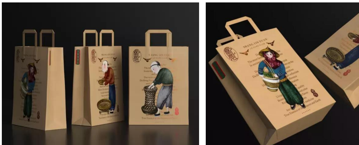
Figure 4. Shanglingyuan tea packaging design