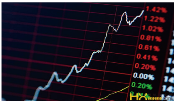
ii. “rational man” and “irrational man”

authorities before they can be issued, and must be in a legal form with legal records.