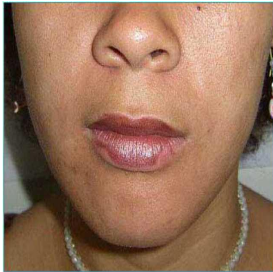
Figure 5. Facial appearance of the patient at the 100-day return visit demonstrating harmonious facial contour