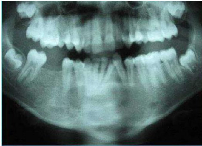
Figure 4. Radiographic aspect showing bone formation observed after 100 days