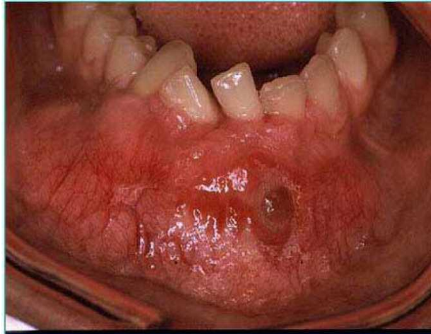
Figure 2. Presents an increase in volume with intra-oral observation

Panoramic and occlusal radiographic exams were performed on the patient, which showed a well delimited radiolucent zone with few radiopaque foci inside, completely involving the dental unit 3.2. It extended from the 1 st left pre-molar to the 2 nd right pre-molar, and the roots of the units involved were quite divergent and some had resorption processes ( Figure 3 ). An incisional biopsy was performed under local anesthesia, together with an aspiration puncture which confirmed the solid nature of the lesion. The histological findings of a cyst wall lined by the proliferation of epithelial cells with central formation of acinar-similar cells with central eosinophilic material and deposition of calcium spherocytes confirmed the diagnosis of AOT, which contradicted the initial clinical suspicion of ameloblastoma, due to the clinical and radiographic features of the lesion.