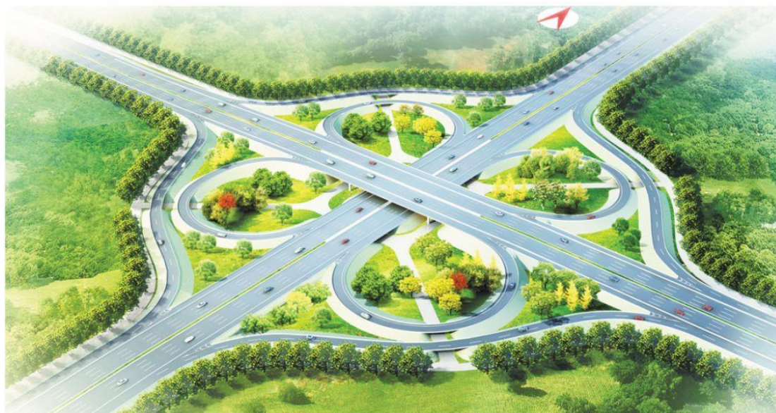
Figure 2. Design drawing of collector-distributor lanes

lanes is determined, the signal timing in each scheme should also be reasonably set. In terms of type of interchange, if the combination of expressway and special lane is adopted, the combination of expressway and dedicated lane should be preferred; and for a full interchange, if the combination of urban expressway and some dedicated lanes is adopted, the combination of expressway and some dedicated lanes should be preferred. According to Article 6.2.5 of the “Code for Design of Urban Road Intersections” (CJJ152-2010) [3], the length of the collector-distributor lanes in urban road engineering is generally 60–80 m, it can be seen that the recommended length of the collector-distributor lanes is 60–80 m, as shown in Figure 2 show.