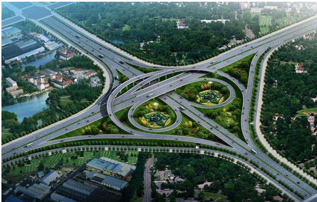
Figure 1. Interchange collector-distributor lanes

The location of the collector-distributor lanes of interchanges should be selected according to the structure of the urban road network, and on the basis of factors such as urban road planning, existing road conditions, traffic flow, and facility layout. Since collector-distributor lanes are mainly set up to alleviate traffic congestion of the forks, the traffic capacity of the forks should be fully considered when selecting the position of the lanes, as shown in Figure 1 .