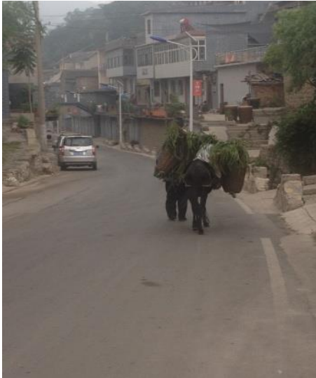
Figure 2. First-level street