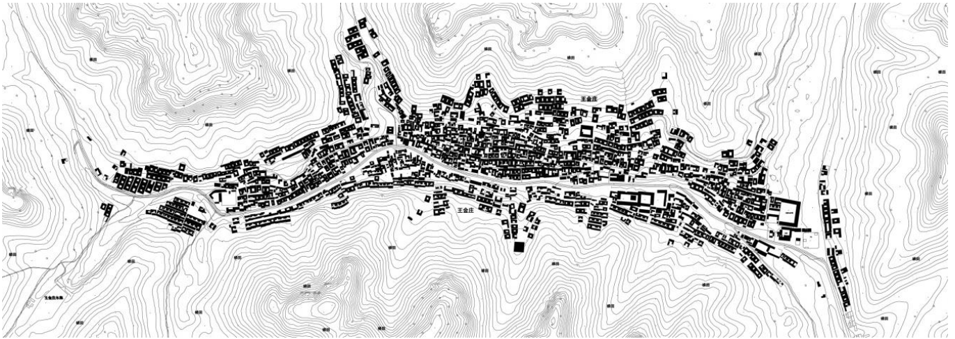
Figure 1. Wangjinzhuang settlement

On the north side of the main street, the buildings are densely distributed with abundant sunshine and a stone-slab street with unique space. Wangjinzhuang settlement gradually developed and expanded. The buildings are covered with mountains on both sides of the valley. The continuous extension to both ends of the main street will cause a deviation from the center, which is not easy to manage. Therefore, the linear layout of Wangjinzhuang is divided into five sections.