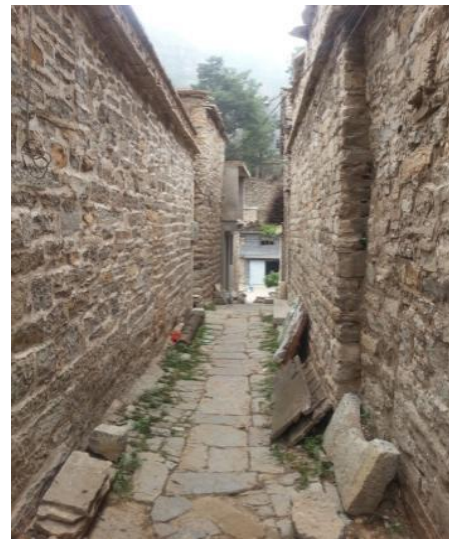
Figure 3. Second-level roadway