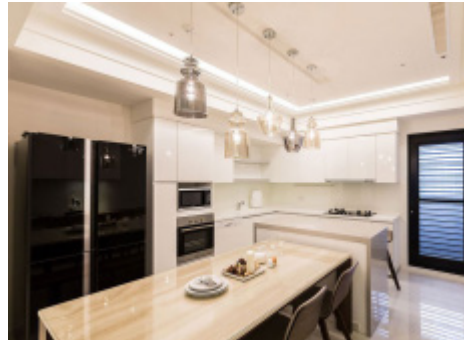
Figure 1 Living room Figure 2 Kitchen