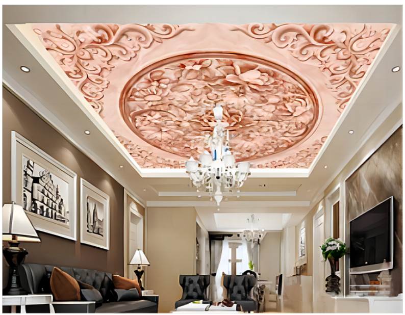
Figure 1. Peony-patterned ceiling

There is a big difference between the ceiling in modern architecture and the ceiling in ancient architecture. The structure of the ceiling in traditional architecture is mainly wooden, while the decoration and structure are more complicated. Some higher-level buildings will set up algae wells, birdbaths, and other complicated structural decorations, and a large number of patterns will be applied, among which the more commonly used patterns include fish, peony or geometric patterns. These patterns are colorful and rich in form [3]. The ceiling design of modern buildings is generally more simple, and the top of a single color, will not use a large number of complex color decorations. Therefore, the application of folk patterns in modern architectural decoration will be innovative based on the original, such as pattern decoration around the lamps or ceilings ( Figure 1 ). The pattern decoration around the ceiling is generally simple, using geometric patterns such as a back-word pattern and swastika pattern, or simple plant and flower pattern, which can be combined with the specific decoration style to determine the pattern form. Most of the patterns around the lamps are based on plant patterns, which are relatively more complex.