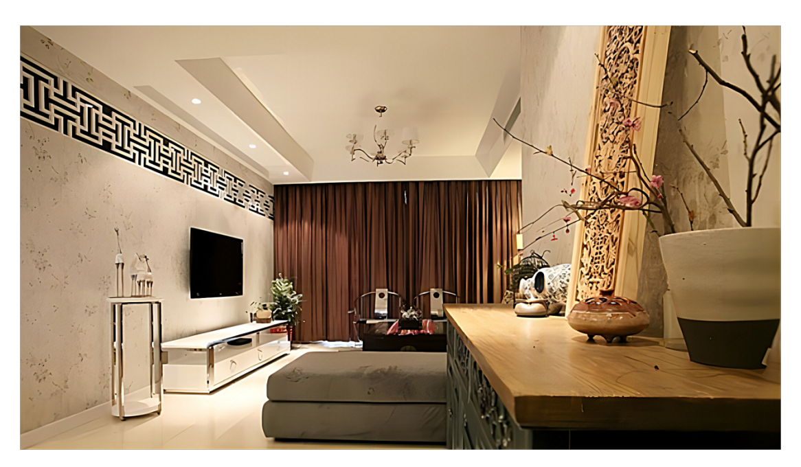
Figure 3. The decoration of the TV background wall

The application of folk pattern elements in architectural design can enhance the humanistic atmosphere of the building, and through the combination of patterns and appropriate changes, the decorative pattern can be formed in line with modern aesthetic. However, in some architectural designs, in order to emphasize the traditional cultural characteristics and create a retro style, folk pattern elements are usually applied directly. For example, the most common "Reversal pattern" is widely used in the architectural design of new Chinese style, which is used in the TV background wall, screen, furniture, and wall decoration of the tea room ( Figure 3 ) <sup>[4]</sup>. At the same time, the application of patterns with auspicious symbols such as plant patterns, fish patterns, and dragon and phoenix patterns is also relatively wide and can be applied to the decoration of various spaces inside the building without strict application requirements.