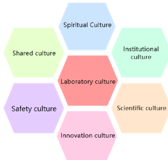
Figure 2. Cultural construction of a six-in-one laboratory

Given the challenges in the construction of laboratory culture, a comprehensive strategy is proposed to develop spiritual culture, institutional culture, scientific culture, innovation culture, safety culture, and shared culture. Spiritual culture serves as the core, institutional culture as the criterion and scientific culture as the connotation. Simultaneously, innovation culture acts as the driving force, safety culture as the guarantee, and shared culture as the direction, embodying a six-in-one strategy that amalgamates cultural elements, as illustrated in Figure 2 .