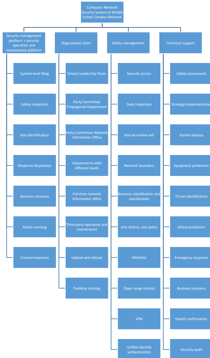
Figure 1. Composition of the computer network security system of the middle school campus network

The computer network security system of the high school campus network consists of four parts, specifically the security management platform + security operation and maintenance platform, organization chart, security management, and technical support ( Figure 1 ).