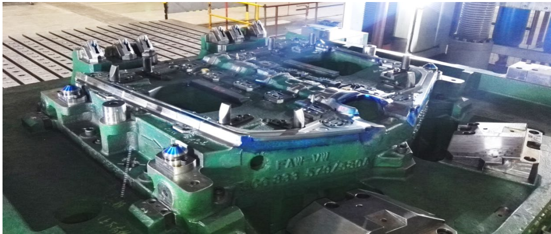
Figure 2. The size of the upper and lower mounting surfaces of the conical interlocks

Therefore, the installation of the conical interlocks should be done before the research and development; it is necessary to take the conical interlock as the reference to ensure that the size of the four conical interlocks are consistent; and to ensure that the accuracy does not change after CNC machining. To summarize, I finally understood the role of conical interlocks