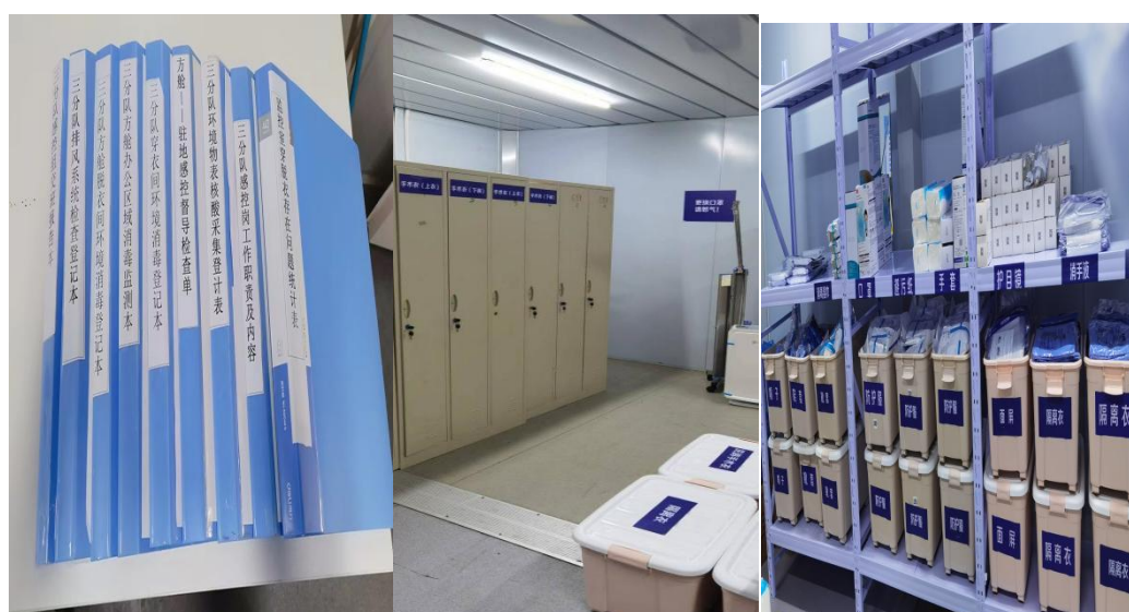
Figure 1. The insides of the Third Unit of Third Branch, Fangcang Shelter Hospital of National Exhibition