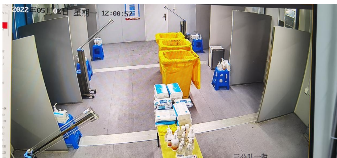
Figure 2. More pictures of the insides of the Third Unit of Third Branch, Fangcang Shelter Hospital of National Exhibition and Convention Center (Shanghai)