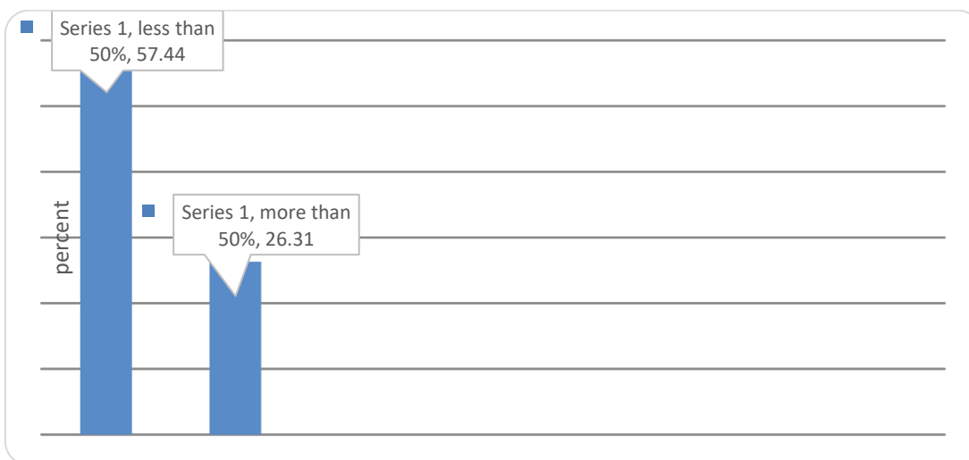
Figure 2. Frequency and distribution of myometrial invasion in MRI

According to histopathologic findings, all the patients were stage IA or IB. Grade I was the most common grade, with 67.92% of patients. In 58.49% of the cases, the myometrial invasion was less than 50%, while in 41.5% of the cases, the invasion was more than 50% ( Figure 3 ). Data analyses showed the low efficiency of curettage and final pathologic reports in cellular grading with significant Kappa value = 0.018.