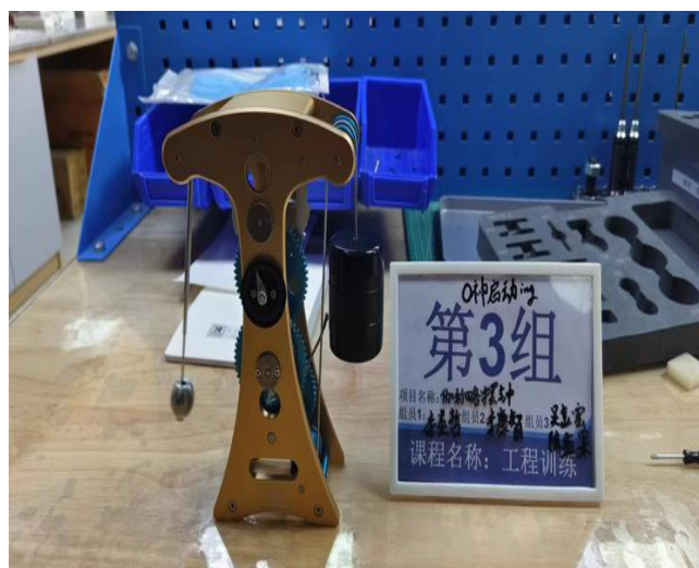
Figure 3. Adaptation project: Galileo's Pendulum