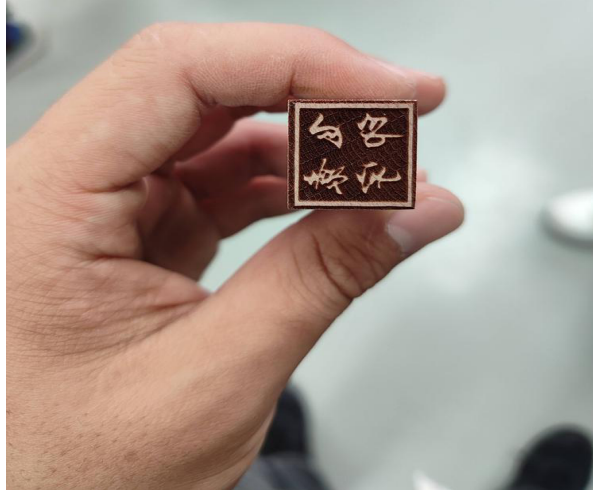
Figure 2. Personal name stamps made by students through laser processing