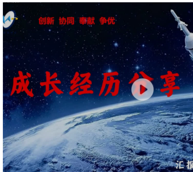
Figure 1. Work Tasks of Outstanding Alumni video