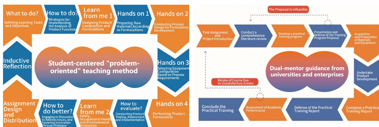
Figure 3. Schematic diagram of the “problem-oriented” teaching and “real project iterative trial-and-error” training method

In experimental and practical training sessions within this course, we invite skilled artisans and industry veterans to participate in teaching, employing a student-centered “problem-oriented” teaching and “real project iterative trial-and-error” practical training approach (Figure 3). Students are assigned development tasks related to cosmetic product projects, which are then taught by a dual-mentor team composed of both school and enterprise instructors. Upon receiving their assignments, students work in groups to complete tasks such as researching information, devising plans, refining proposals, executing strategies, and summarizing experiences, gaining firsthand exposure to the development process of cosmetic products. This methodology aims to foster students’ practical working capabilities and cultivate a spirit of pragmatic innovation in scientific endeavors.