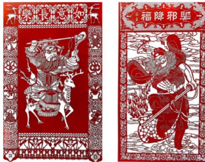
Figure 6. On the left is a Menjian with an auspicious theme of lasting joy and luck (40 cm in width, 60 cm in height). On the right is Menjian with the theme of dispelling evils to bring happiness (50 cm in width, 103 cm in height). Pictures are taken from Research on Paper-Carving in Jintan from the Perspective of Intangible Cultural Heritage .

performing activities with a grand scene. The pavilion is a wooden skeleton supported by a six-foot-long and five-foot-wide square base, on which the actors can stand to perform. In order to enhance it aesthetically, Jintan paper carving is used as decoration [16] . In addition, the tradition of dragon dancing is evident in Jintan. The dragon is made of bamboo stripes and decorated with leather cloth and paper carving. The theme is mainly auspicious patterns, imploring good weather to prevent disasters. The local people prefer to decorate their door frames with paper carving. This is called “Menjian” (paper-cut or paper-carving works used to adorn the upper door frame). With delicate and meticulous style, the theme is the same: dragon dancing decoration to pray for good fortune, ward off evil spirits, and prevent disasters (Figure 6) [17] .