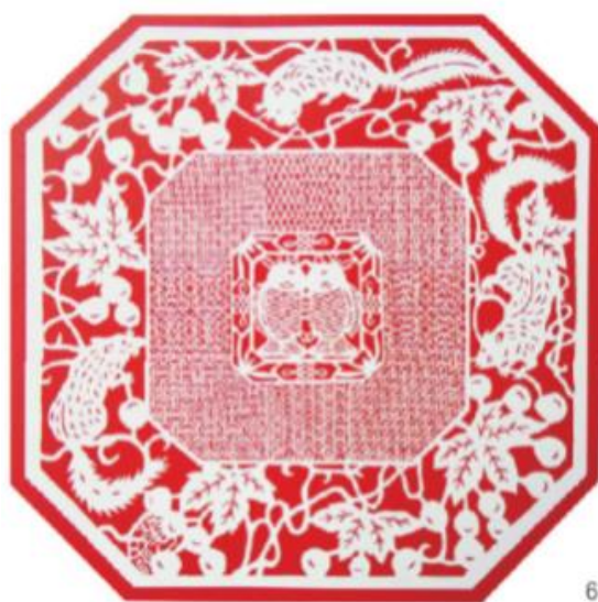
Figure 1. Eight-cornered fish, designed by Kezhengming and made by Chenzhaofen in 1956, measuring 12.5 cm (width) × 12.5 cm (length). The outer part is engraved with patterns of shoe flowers, squirrels, and grapes; the middle part is engraved with a fine pattern of dragon boat flowers; while the inner part is engraved with a figure of two fishes.

Yellow River. At that time, the rich regional environment nurtured the Huaxia tribes, accumulating the Xia, Shang, Zhou, and Qin cultures. Totemic cultural and related graphic connotations have been handed down to this day. For example, fish and frogs represent a strong ability to reproduce in totemic culture. In traditional Shaanxi papercut, other than individual fish and frog shapes, many works combine a human's face with a fish or a frog. In addition to expressing admiration and worship, these works reflect people's desire for this power to come upon them and bless their families. They are, in fact, manifestations of totemic personifications [6].