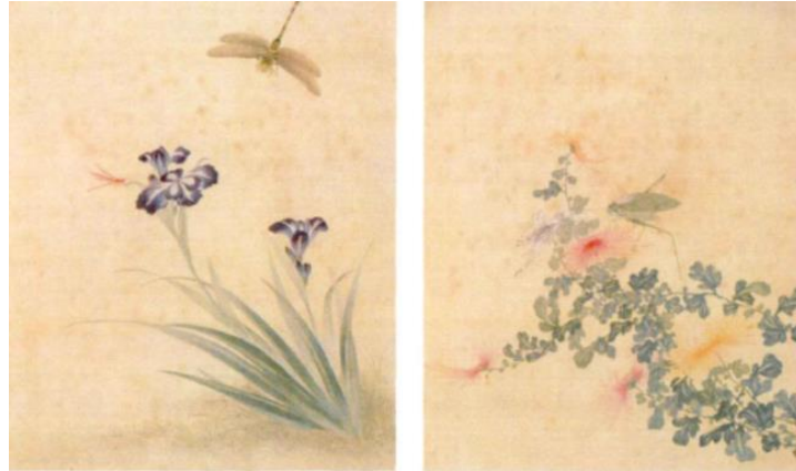
Figure 10. Works by Baojun. On the left is a cut-and-paste work titled “Iris and Dragonfly”; it is 27 cm in width and 31 cm in height. On the right is a cut-and-paste work titled “Blue Chrysanthemum and Katydid”; it is 27 cm in width and 31 cm in height. Pictures are taken from A Study Imitating Painting Phenomenon of Contemporary Yangzhou Paper-Cut .

This kind of cultural custom embodied in papercut has been inherited and carried forward in the modern Yangzhou Zhang’s family paper-cut inheritance. Zhangyongshou (1907–1989), the 5th generation inheritor of Zhang’s papercut, often visited Yangzhou Museum to appreciate the works of “Yangzhou Eight Oddities” (Yangzhou Ba Guai), which represents a group of painters and calligraphers with similar styles who were active in Yangzhou from the mid-Kangxi period to the late Qianlong period of the Qing Dynasty (1690 AD–1795 AD), also known as Yangzhou Painting School in Chinese art history. It had a great influence on modern Chinese flower-and-bird painting and promoted the comprehensive development of many crafts including papercutting [25] .