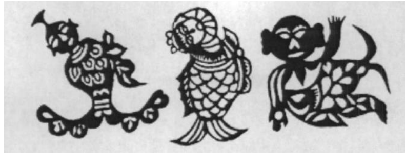
Figure 2. From left to right: salamander, fish head, fish mermaid. Pictures are taken from Exploration and Research on the Traditional Folk Paper-Cut of Shaanxi Province .