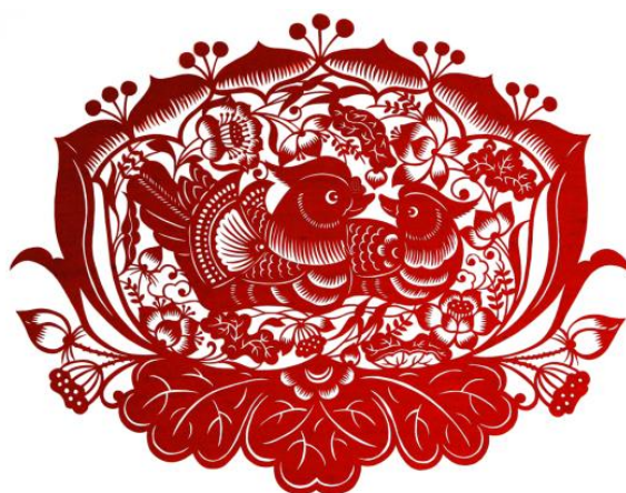
Figure 12. Nanjing paper-cut work "Yuanyangxihe" (Mandarin Ducks Play Round the Lotus) by Zhangfanglin (1949–present), the 4th generation inheritor of "Jinlin Shengjian Zhang." Pictures from Zhangfanglin's Declaration of National Intangible Culture Heritage .

In general, Yangzhou and Nanjing papercuts show strong literati traits. Yangzhou papercut cleverly draws on the characteristics of Ming and Qing literati paintings, with a beautiful, clever, natural, and smooth image. Nanjing papercut relies on cultural accumulation and folk activities, with auspicious meaning as the theme. It is mellow and full, with smooth details and a distinct block surface. Both Yangzhou and Nanjing