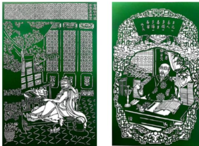
Figure 7. On the left is a Jintan paper carving with the theme of the medical scientist Wangkentang of the Ming Dynasty (45 cm in width, 74 cm in height), with no frame, based on the portrait composition. On the right is a Jintan paper carving with the theme of Master Puxue Duanyuzai of the Qing Dynasty (45 cm in width, 71 cm in height). Its border is decorated with a mirror contour. Pictures are taken from Research on Paper-Carving in Jintan from the Perspective of Intangible Cultural Heritage .