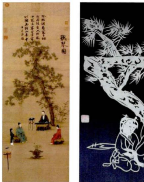
Figure 11. On the left is the work “Tingqintu” (Listening to Qin) by Zhaojie (1082 AD–1135 AD) in the Song Dynasty; it is 51.3 cm in width and 147.2 cm in height. On the right is the work “Fuqing” (Play the Zither) by Zhangmuli (1960–present). Pictures are taken from The Story of Chinese Traditional Painting .

For example, the work “Fuqing” (Play the Zither) by Zhangmuli (1960–present), the 6th generation inheritor of Zhang’s papercut, is based on the work “Tingqintu” (Listening to Qin) by Zhaojie (1082 AD–1135 AD) of the Song Dynasty. In part of Zhangmuli’s work, we can see the image of a pine tree and ganyemede similar to those in Zhaojie’s painting (Figure 11).