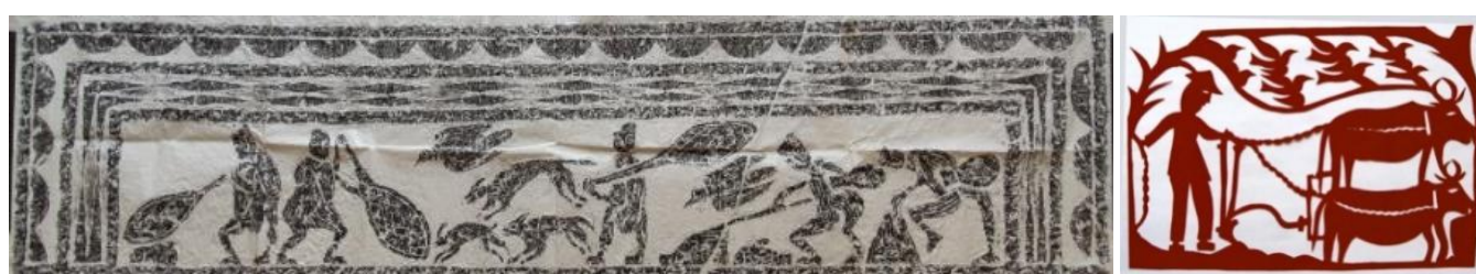
Figure 4. The left picture shows a Han Dynasty rubbing of fishing and hunting (160 cm in length and 39 cm in height), from the Han Dynasty Portrait Gallery, Yi Shin Zhai. The right picture is taken from Wangguiying Paper-Cut .

Xuzhou Han stone relief mainly revolves around traveling by car and horse, cooking and drinking, as well as textile life [10] . Xuzhou papercut, on the other hand, mainly revolves around life scenes, including chickens, ducks, cattle, sheep, and horses, farming, and textile production. A local Han stone relief and papercut are shown below, both of which reflect the scene of production and labor. The left diagram depicts a scene of people fishing and hunting. The people in it were with a hooked net, cormorant fishing in the water. The right diagram shows a work by Wangguiying (1940–present), the inheritor of Xuzhou paper-cut art tradition. It depicts a labor scene of a farmer leading two cows. Although the subject contents of labor are different, these two works are related to production and life in a similar naive and generalized form (Figure 4).