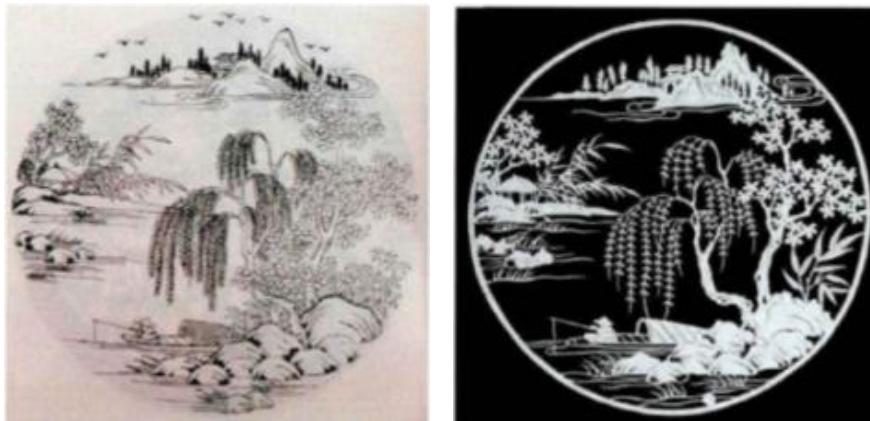
Figure 9. Some of the images of Yangzhou papercut are from embroidery patterns. On the left is an embroidery pattern, named Riverside Fishing Alone. On the right is a pattern by Zhangxiufang (1943–present), who is the 6th generation inheritor of Yangzhou paper cut, titled Shanshui (Landscape); it is 48 cm in width and 48 cm in height and was created in 2008.

The development of various crafts promoted by economic prosperity has contributed to the development of Yangzhou papercut. However, the literati painting of the Qing Dynasty, especially the painting style in and around the Yangzhou area, has the greatest influence on shaping the characteristics of Yangzhou papercut. Since the Ming and Qing Dynasties, some literati have participated in paper-cut creation. With higher cultural attainment, they prefer elegant literati poetry and painting themes, thereby constantly transforming local papercuts from simple, practical folk forms to ornamental forms. A large number of works with images of literati paintings such as flowers, birds, fish, insects, plums, orchids, bamboos, and chrysanthemums are present in the preserved Yangzhou papercut during that time [22] . For example, Baojun (fl.), a well-known Yangzhou painter in the Qing Dynasty, combined papercuts and literati painting with historic records and textual evidence [23] . He used scissors to shape flowers, birds, plants, fish, and insects and then utilized coloring and dyeing, which reflected his talent in Gongbi (traditional Chinese realistic painting skill) [24] . Baojun’s work, “Colored Birds and Insects” is exhibited in Zhenjiang Museum and combines cutting and painting, as well as cutting and calligraphy ( Figure 10 ).