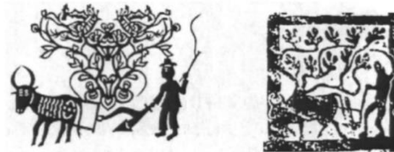
Figure 3. From left to right: “GenNiuTu” (Tilling a Cow) by Baifenglan (1920–1990) of Ansai; “NiuGenTu” (Cow Cultivated Land) unearthed in Suide, northern Shaanxi (1962). Pictures are taken from Exploration and Research on the Traditional Folk Paper-Cut of Shaanxi Province .