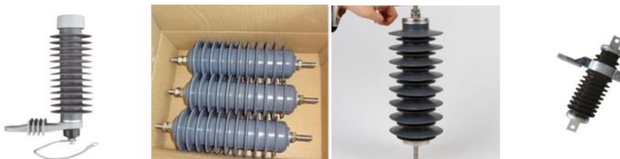
Figure 5. Parafoudre à oxyde métallique sans éclateurs pour réseaux à courant alternatif ( jiāo liú wú jiàn xì jīn shǔ yǎng huà wù bì léi qì in Pinyin )

In another example, although there are more modifiers in the phrase le parafoudre à oxyde métallique sans éclateurs pour réseaux à courant alternatif than the previous one, the head word can be easily found: parafoudre . After positioning it, the modifier is split into three parts according to the position of the preposition: the first part à oxyde métallique , the second part sans éclateurs , and the third part pour réseaux à courant alternatif . After combining these three parts, the term can be tentatively identified as jiāo liú wú huǒ huā jiàn xì jīn shǔ yǎng huà wù bì léi zhēn . After typing it into Bing (Chinese Version), the most frequently appearing keyword is jiāo liú wú jiàn xì jīn shǔ yǎng huà wù bì léi qì . The image retrieval results are shown in Figure 5 .