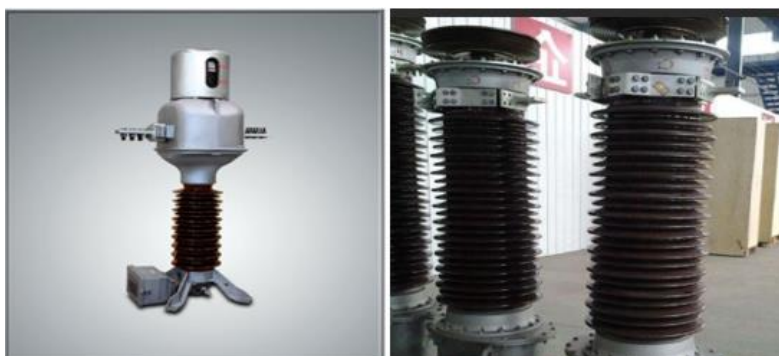
Figure 4. Transformateur de courant de l'huile inverse ( yóu jìn dào lì shì diàn liú hù gǎn qì in Pinyin; photo source: https://cn.bing.com/images/search?q=%e6%b2%b9%e6%b5%b8%e5%80%92%e7%bd%ae%e5%bc%8f%e7%94%b5%e6%b5%81%e4%ba%92%e6%84%9f%e5%99%a8&form=HDRSC2&first=1 )

Its modifier l'huile inverse is related to huile (oil) and inversé (inverted). Therefore, the complete translation can be tentatively identified as an “oil inverted current transformer.” However, the accuracy of the translation is debatable; the only thing that can be certain is that the current transformer might contain oil and be inverted. Hence, two translation forms could be deduced: dào zhì shì chōng yóu diàn liú hù gǎn qì and yóu jìn dào lì shì diàn liú hù gǎn qì . In order to improve the accuracy of the translation, these two translations should be typed into Bing (Chinese version) for image retrieval. The results are displayed in Figure 4 .