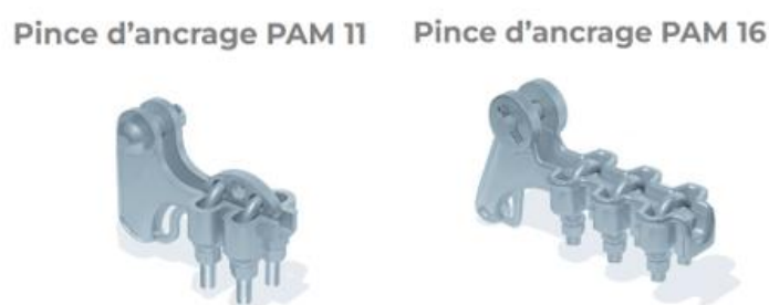
Figure 1. Pince d’ancrage ( nài zhāng xiàn jiǎ in Pinyin )

For instance, although the term pince d’ancrage literally means máo dǐng jiǎ , it has another term exclusive to the field of the transmission line. Translators could give a quick translation by “keyword retrieval + technique clarification.” Specifically, we can start by typing pince d’ancrage into the retrieval engine Bing (International version) and find the definition of pince d’ancrage : Les pinces d’ancrage et les fixations sont utilisées en arrêt de ligne ou lorsqu’il y a changement de direction de câbles (in English: Anchor clamps and fasteners are used in line stops or when there is a change in the direction of the transmission line). The result of the images search is shown in Figure 1 .