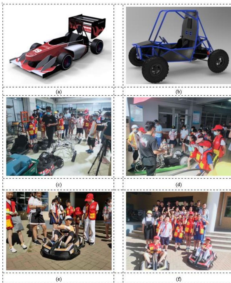
Figure 2. Little journalists learned knowledge and drove cars in the training base