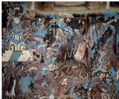
Figure 1. "Laying Down Oneself to Feed the Tiger" in Cave 254 of the Mogao Grottoes

With the introduction of Buddhist art in China, many paintings were seen along the Silk Road and found in many grottoes in the form of frescoes, being expressed in different ways. The paintings are illustrated in Caves 38, 178, and 47 in Karakoram Mountains, Kizil Grottoes, Cave 63 of Kumutula Grottoes, Binyang Middle Cave of Longmen Grottoes, Cave 165 of Qingyang North Grottoes, as well as Cave 127 in Maiji Mountain. However, most of the paintings are rather brief. There are 16 caves (Cave 301, 302, 299, 428, 254, 417, 419, 237, 231, 85, 9, 146, 98, 108, 72, and 55) in the Mogao Grottoes for the size of the painting, "Laying Down Oneself to Feed the Tiger" ( Figure 1 ), from the northern Wei Dynasty to Song Dynasty, of which a unique form of painting has been found in Cave 254, which has become the most unique painting style.