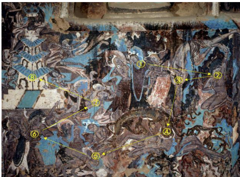
Figure 3. Eight plots of “Laying Down Oneself to Feed the Tiger” in Cave 254 of the Mogao Grottoes

In Cave 254 of the Mogao Grottoes, “Laying Down Oneself to Feed the Tiger” was painted on the southern wall of the main room ( Figure 2 ). It is different from statue paintings, and it is not limited to strict religious rituals. In that sense, painters can break the rules and use their own imagination when drawing such paintings. The composition and layout of the painting plays a crucial role in the whole picture. The attention to composition has been clearly documented as early as during the Southern and Northern Dynasties. The elaboration of the “Six Laws” by Xie He is a summary of picture compositions. “Laying Down Oneself to Feed the Tiger” in Cave 254 has 20 characters, 8 tigers, five goats, two deers, and a monkey strewn at random overlapping mountains. It also displays a solemn monastery in less than two square meters map on the wall with eight different space-time plots ( Figure 3 ), imaging with a winding-type composition. The eight plots are in chronological order: (1) the tiger watching; (2) the thorns; (3) the vertical cliff; (4) meeting the tiger; (5) picking up the skeletons; (6) the news; (7) the cry; (8) the support. The whole picture is solemn and quiet, giving rise to a solemn yet stirring atmosphere.