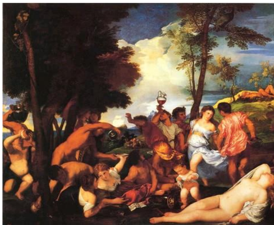
Figure 1. Bacchanal (1523-1524) by Tiziano Vecellio

On the one hand, Western classical paintings express the reality of the world, but on the other hand, they express the harmony of space. Their paintings have a strong visual impact, strict scientificity, and harmonious rational thinking. In Hegel's summary of painting, he stated, "Each style aims at depicting nature faithfully, and nothing else, but each has a different concept of nature." Three-dimensional angles illustrate the relationship between color brightness, purity, and hue. Through the analysis of spectral tones, there is a color relationship, a color circle, the relationship between color and light, as well as the relationship between color and vision. The shadow of the object is the complementary color of the light source, and the external light sketching draws the shadow of the scene into vivid colors. Note that the rational attitude of rewriting reality creates the pursuit of true spatial depth and infinite spatial awareness in art.