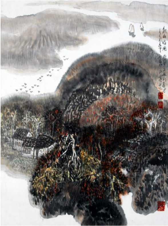
Figure 6. Evening Song of Qiushan by Wang Yongliang