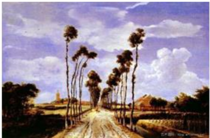
Figure 4. The Avenue at Middelharnis by Hobbema

The second is the perspective method of light and shade which is also commonly referred as the method of light and shade. This method uses the technique of presenting a three-dimensional effect of an object on a two-dimensional plane. The chiaroscuro method came to a mature stage in the heyday of the Renaissance. Leonardo believes that objects in the objective world use light and shade to present images; hence, paintings should also focus on expressing light and shade rather than depicting contours. Seek balance in contrast, and contrast in balance. In the shaping stage, shadows are important in chiaroscuro because if there are no shadows, the boundaries of opaque three-dimensional objects would be unclear. The coordinated relationship formed by the changes in the overall painting, the strength and distance from the light source, the decent turning of the object, and factors such as forward light, backlight, ambient light, high light, and bottom light would change the texture of the object.