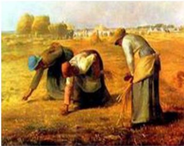
Figure 3. The Gleaners by Miller

The spatial representation of Western paintings is the result of the scientific use of perspective. In da Vinci's opinion, a picture is like a mirror which must present a real three-dimensional scene in a two-dimensional plane. Like Repin's "Barge Haulers at Volga," scientific methods such as perspective, light, and color have been used to paint the real things that are seen. This embodies a technique of Western paintings. The first is the focal perspective method where the accurate perspective relationship on the screen is an important feature of the spatial processing in Western paintings. Lessing, the 18 th century literary theorist said, "Only visual experience, making the far things smaller than the near ones is far from enough to constitute the perspective of a painting. Perspective must have a specific point of view and a clear view of nature; these are what ancient paintings did not have." Observing the shape of objective things is mainly based on vision and the shape of various things can show the shape of the object only with the help of light. Comparing "The Gleaners" by Miller ( Figure 3 ) and "The Avenue at Middelharnis" by Hobbema ( Figure 4 ), the former depicts more spatial levels. Placing the horizon line very low, it can be appreciated that the position of the artist is also very low and the strong one-point perspective of "The Path in the Woods" has strong visual impact.