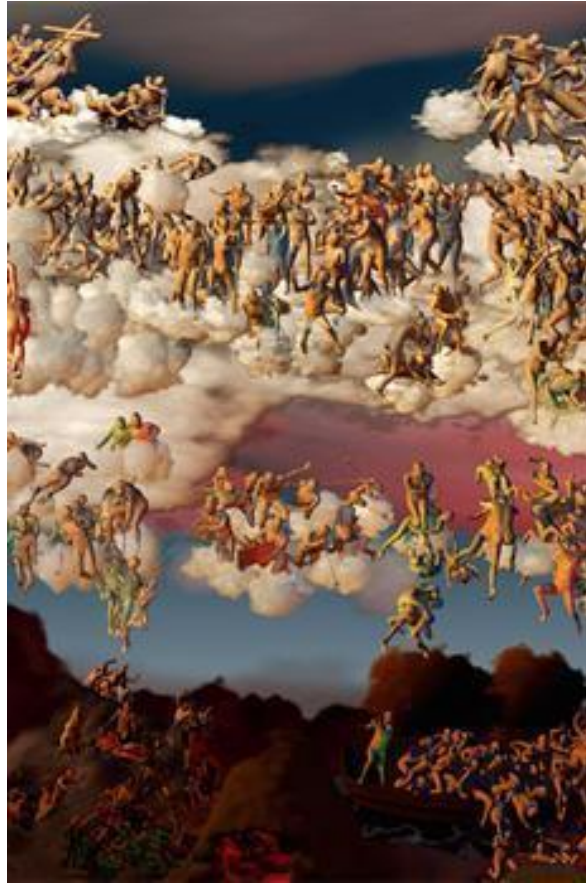
Figure 5. The Last Judgement by Michelangelo