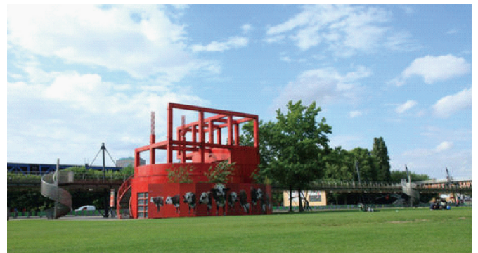
Figure 1. La Villette Park in Paris

out clearly that the definition of architecture can not be form and wall, but can only be the combination of various heterogeneous and incompatible factors. In his Deconstructive Architecture, architectural appearance is no longer an aesthetic whole. He constantly challenges people's aesthetic limit and expands the scope of architecture infinitely "Zero aesthetics" or "anti aesthetics" design. In the sense of design form, it breaks with the stable, static, permanent and non prospective concept of traditional architectural aesthetics. La Villette Park in Paris is his representative work (Figure 1).