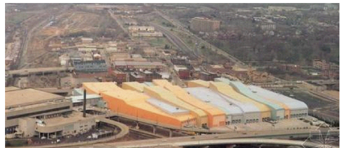
Figure 2. Columbus Conference Center

The idea of Eisenman's architectural deconstruction philosophy is that it perfectly integrates the materiality of architecture with the ideality of philosophy. His architecture, Columbus Conference Center, shows a very distinctive structure (Figure 2). The conference center is composed of several interdependent but formally independent structures. Both the external decoration details and the interior design fully show the strong tearing feeling of careful treatment. From the high altitude, the whole building seems to be 11 buildings crisscross with each other, but the whole building is well arranged.