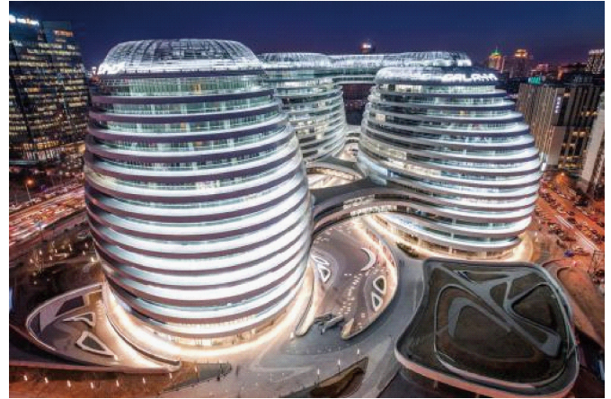
Figure 4. The galaxy SOHO

between her architecture and the deconstruction idea. However, Hadid admits that there is a deconstruction element in her architecture, and she is deeply influenced by deconstruction. But she also said that her inspiration is not only from Malevich's supremacy and Derrida's deconstruction.