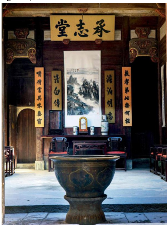
Figure 1. Interior Furnishings and Carvings of Cheng Zhi Hall.

Cheng Zhi Hall is the largest traditional dwelling within Hongcun, which was built in the 5th of reign of Emperor Xianfeng of Qing Dynasty (1855) and covers an area of 1639 m 2 . Both the front hall and the back hall bear the corridor structure of Two Floors and Three Rooms and are composed of a main hall, a study, a scripture hall, a pond, a garden, a kitchen and an ancient well. The whole dwelling consists of 28 rooms, which are magnificent and glittering with exquisite carvings, red columns and golden beams (Zhang Xinrong, 2013). Therefore, Cheng Zhi Hall is honored as Civil Forbidden City and used as the exhibition to the public (see Figure 1).