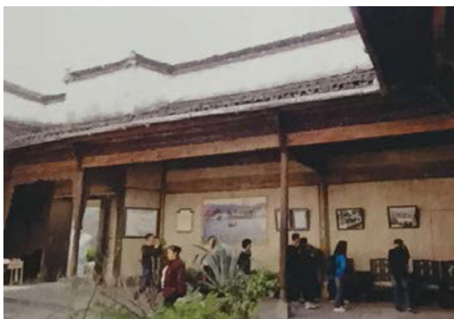
Figure 3. The actual intervention of Front Fei Zhao (Above before restoration and below after restoration).