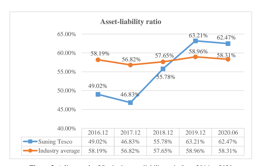
Figure 3. A line graph of Suning's asset-liability ratio from 2016 to 2020

The asset-liability ratio indicates the repayment ability of assets to liabilities. As can be seen in Figure 3 , Suning's asset-liability ratio from 2016 to 2018 fluctuated between 40% and 60%, which was lower than the industry average in a reasonable range. In 2019, the company's asset-liability ratio rose sharply to 63.21%. Since then, it has been slightly more than 60%, about 4% higher than the industry average. Therefore, it is inferred that the M&A has reduced Suning's long-term solvency.