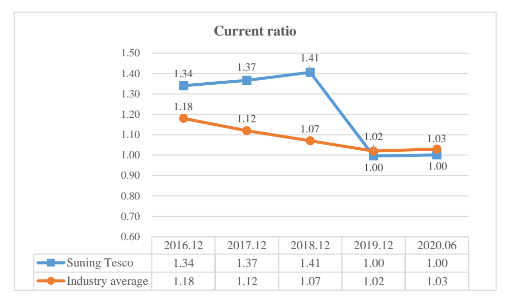
Figure 2. A line graph of Suning's current ratio from 2016 to 2020