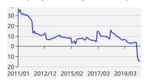
Figure 1. General public budget income

with the national general public budget revenue of RMB 6213.3 billion, down 14.5% year-on-year (Figure 1). From January to April, the national general public budget expenditure was RMB 7359.6 billion, down 2.7% year on year (Figure 2). Obviously, China's public revenue and public budget are showing a downward trend. Since the outbreak, in order to prevent the spread of the epidemic, many schools in China have been shut down, small and medium-sized enterprises have lost their economic income and faced the risk of bankruptcy, while college students who are close to graduation are also facing the risk of unemployment, economic downturn, imperfect financial construction and immature economic subject, which are all problems faced in the construction of "one belt one road" in the international economy. The financial downturn in China's early stage is the emergence of these problems.