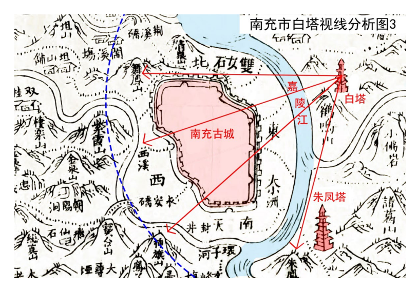
Figure 3. Baita tower sight analysis 3

Baita by the Jialing River is far away from the ancient city of Nanchong across the river and opposite to the Zhufeng Tower. It has a great advantage for its geographical position, and because Baita was built on the Mount Heming on the Jialing River in the east of the city, it is decorated with a mountain and becomes a famous spot in Nanchong, so it attracts many tourists for versify and painting. During the reign of Emperor Kangxi of the Qing Dynasty, Cheng Yuanbin wrote the poem "Tour in Baita": "The momentum of Baita tower is like poetry, calming down the roaring waves of river. The Baita tower stands by the temple in solemn silence, surrounded by the radiance of the sun. Its reflection falls upon the cold, crystal-clear lake. Climbing on the tower and looking around, the beautiful mountains stretch on and on. Look far into the distance there are endless broad valleys. Every time the monks on the mountain are chanting, the tolling of bells echo into the clouds." [1]