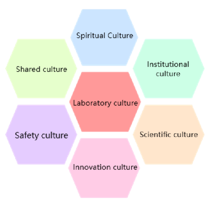
Figure 2. Cultural construction of a six-in-one laboratory

Given the challenges in the construction of laboratory culture, a comprehensive strategy is proposed to develop spiritual culture, institutional culture, scientific culture, innovation culture, safety culture, and shared culture. Spiritual culture serves as the core, institutional culture as the criterion and scientific culture as the connotation. Simultaneously, innovation culture acts as the driving force, safety culture as the guarantee, and shared culture as the direction, embodying a six-in-one strategy that amalgamates cultural elements, as illustrated in Figure 2 .