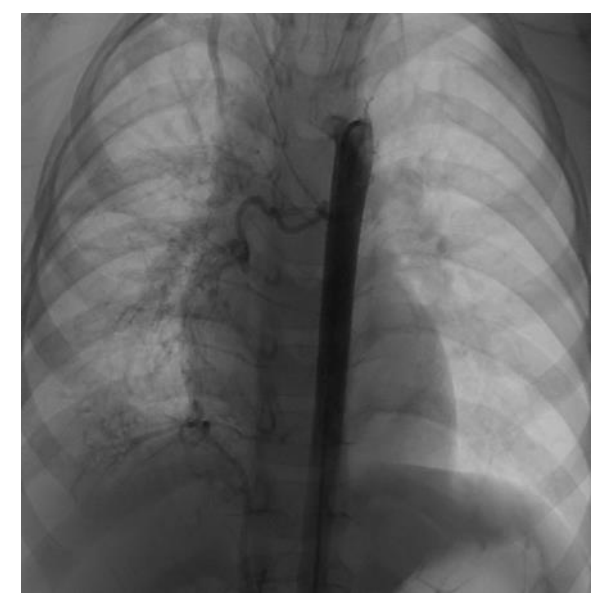
Figure 4. Patient aortography. Note: Angiography of the descending aorta showed the formation of two pulmonary collateral vessels, both supplying the right lung tissue, which were occluded with coils during the operation.