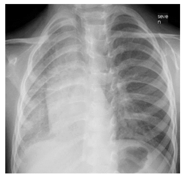
Figure 1. Chest X-ray. Note: The patient's right thorax was slightly smaller, the mediastinum was shifted to the right, the right lung markings were thickened, and the heart shadow was to the right.