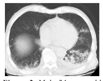
Figure 2, Male 24 years old Subpleural or along the bronchial blood in the lower lobe of both lungs. Mildly dilated bronchus and thickened vascular shadow. A rounded grinded glass-like shadow, with some small flaky solid lesions