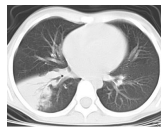
Figure 3, Female 31 years old, large flaky solid lesions in the lower lobe of the right lung