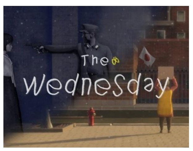
Figure 1. The Wednesday

An elderly lady, who was protesting in front of the Japanese Embassy in 1992, suddenly returns to the day before her friends disappeared in 1945. At that time, the lady was a comfort woman in the Japanese military. It is a puzzle adventure game in which she finds clues about her friends' disappearance and attempts to discover the truth.