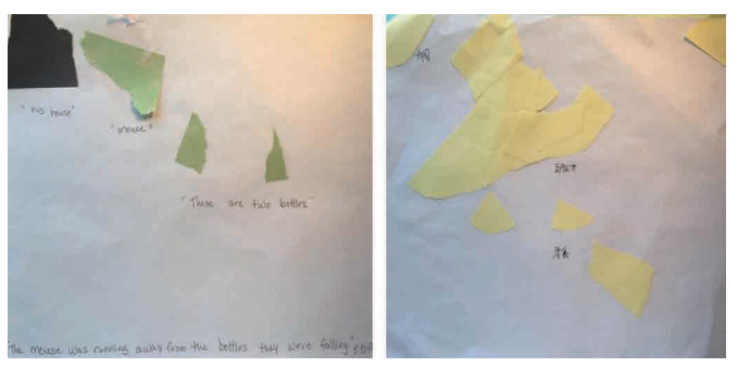
Finding 1. What did the children create?

be developed. From analysis of the daily schedules of the two preschools in this study, different methods of instruction were found between the American and Chinese preschools.