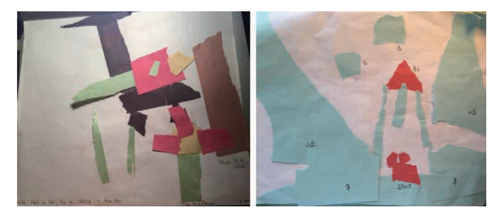
Figure 5. Dynamic visualization with the surrounding natural environment created by an American child (left) and a Chinese child (right)

The child created a mouse and created a mouse hole for him.