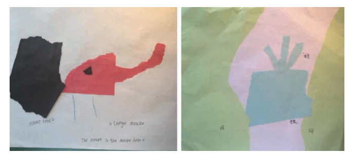
Figure 4. A static schematic visualization with a mouse hole created by an American child (left) and a Chinese child (right)

The child created a mouse and created a mouse hole for him.