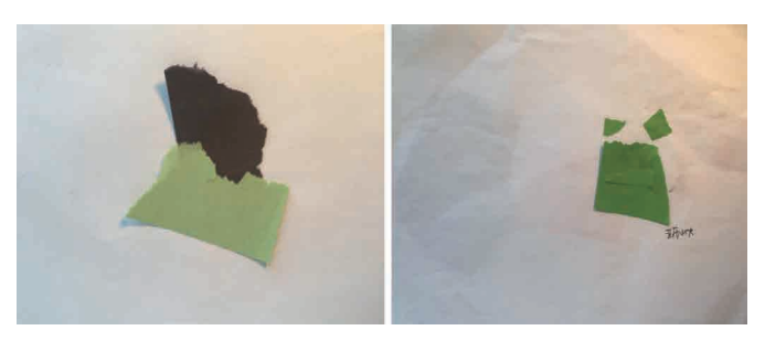
Figure 3. A static schematic visualization created by an American child (lift) and a Chinese child (right)

The artwork was created with different shapes of torn paper pasted together. The collage represents the mouse's home and sea or clouds.