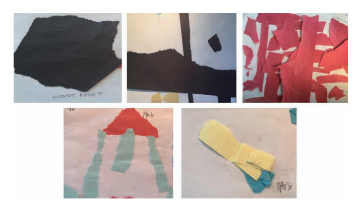
Figure 6. The residence created by American children (top row) and Chinese children (bottom row)

Finding 2. The expression of residence, Alexander (a real mouse described in the story) and wind-up mouse (toy mouse in the story)