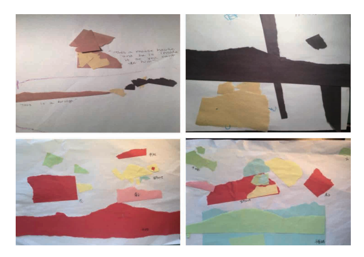
Figure 8. The subjects covered and colors chosen in children's artwork by American children (top row) and Chinese children (bottom row)

The researcher found that the content of the American children's artwork are relatively simple, and the Chinese children's artwork contains richer subjects. Five of American children focused on one subject in their work, including the house, mouse, mouse-trap, and boat. There were five children who included two subjects in their artwork, either a mouse with roads, or a mouse with a house. There was one child who had three subjects in the artwork. The artwork combined bottles, mouse holes and a mouse. The story of this artwork was the mouse is running away from the bottle which is on its way home. There was only one child who had five subjects expressed in the artwork which included the story of the mouse driving the Lamborghini sports car on the road, with flowers and grass on the sides of the road.