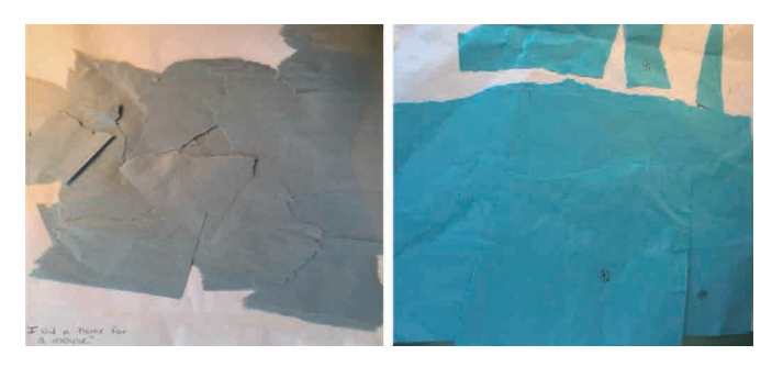
Figure 2. Different shapes of torn paper creating a collage by an American child (lift) and Chinese child (right)

The collage samples demonstrate the use of different shapes: a triangle, rectangle, trapezoid, and fan. These shapes illustrate different symbols in their artwork.