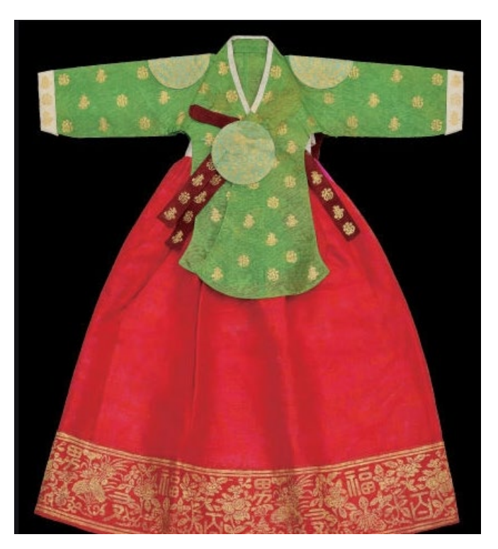
Figure 2. Korean national costume

time to lead students to experience the Korean national etiquette and culture, such as carrying out the Korean festival customs and culture, folklore and culture games, etc., enhance students' experience of Korean